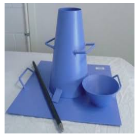
Fig. 2: Slump Cone Apparatus

The Slump Cone apparatus for conducting the slump test essentially consists of a metallic mould in the form of a frustum of a cone having the internal dimensions as: Bottom diameter: 20 cm, Top diameter: 10 cm, Height: 30 cm and the thickness of the metallic sheet for the mould should not be thinner than 1.6 mm.