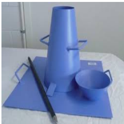
Fig. 2: Slump Cone Apparatus

The Slump Cone apparatus for conducting the slump test essentially consists of a metallic mould in the form of a frustum of a cone having the internal dimensions as : Bottom diameter : 20 cm, Top diameter : 10 cm, Height : 30 cm and the thickness of the metallic sheet for the mould should not be thinner than 1.6 mm.