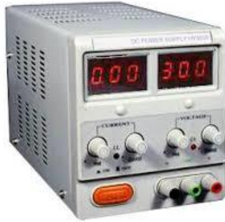
Figure 1: DC Power Supply