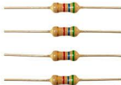
Figure 3: Resistors