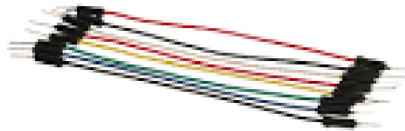
Figure 4: Connecting Wires