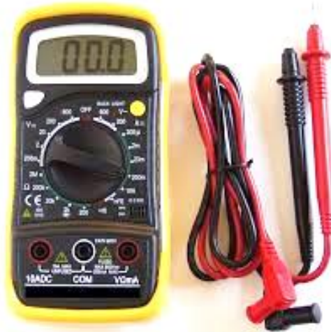
Figure 2: Digital Multi Meter