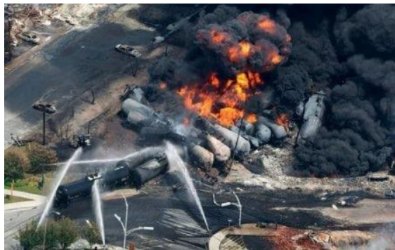
Explosion of Bitumen tanks Due to Excessive Temperature

Catching fire is very dangerous during mixing of bitumen especially during its application. So, it is necessary to recognize the safe temperature values of bitumen grades for mixing as well as for applying. The limited values of temperature can be determined by conducting Flash point and Fire point test on bitumen.