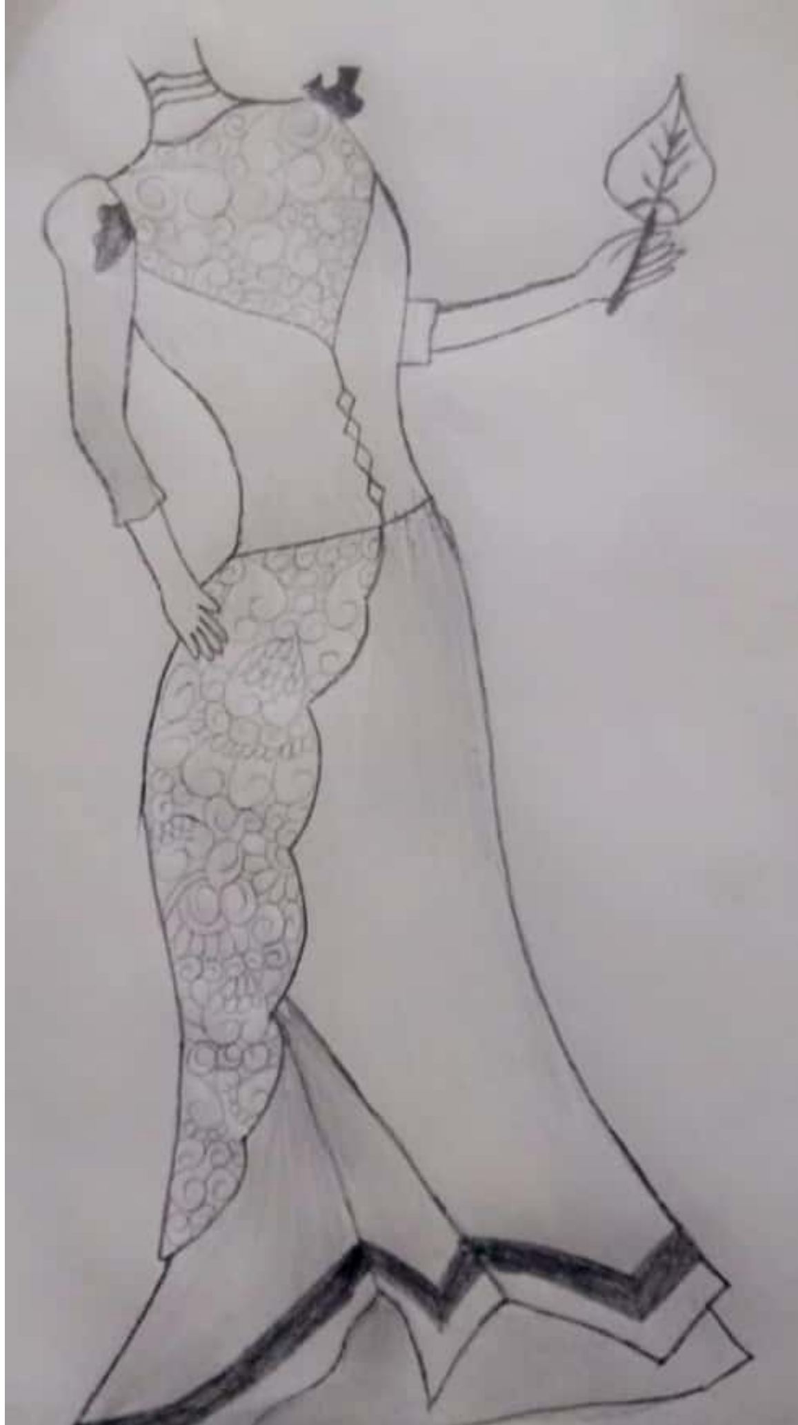
“S curve silhouette”