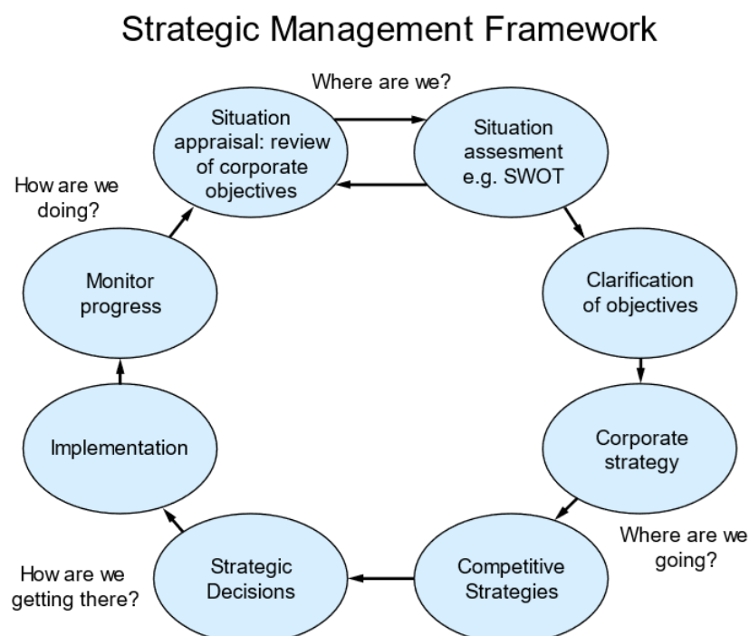
Figure 3. Thompson’s and Martin’s Strategic Management Framework