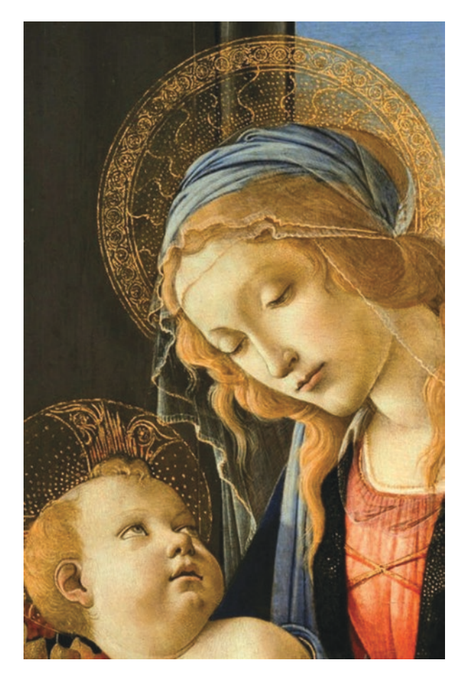
Fig. 10.9 The Madonna of the Book (1483), Sandro Botticelli

The distinct reason for this include the lack of lines on a child's face and the nature of subsurface scattering through layers of fat below the skin. A very well-understood fact in modern 3-D graphic rendering, the phenomenon is increased when the face is struck by soft bounced daylight and is undercut by harsh direct light. This reflected glow of bathed and bathing light is why Bernini's smoothed marbled faces convey innocence and inner light. It is also why Audrey Tatou with