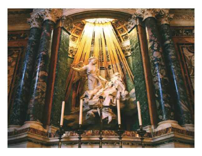
Fig. 10.1 Ecstasy of St. Teresa (1647–1952) by Gian Lorenzo Bernini

describes modestly as "the least bad work" he did. Bernini's singular achievement of sculptural Dantean space unifies a building, natural light and sculpture to create an envelope that brings us into the ecstatic experience of St. Teresa.