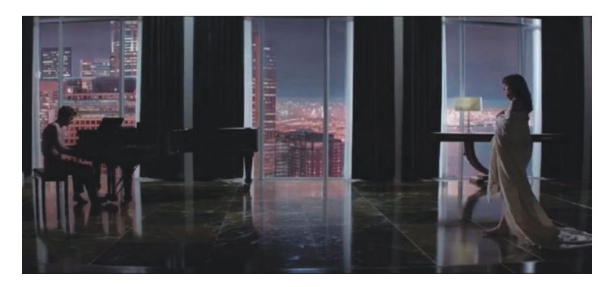
Fig. 4.1 A typical space of Christian's house in 50 Shades of Grey (2015)

One of the problems with these locations is that they do not seem even lived-in. In Chap. 9 we will see this kind of alienating production design, this plethora of unconsumed consumer goods, in other films and TV shows such as Mad Men , where this design strategy serves a different