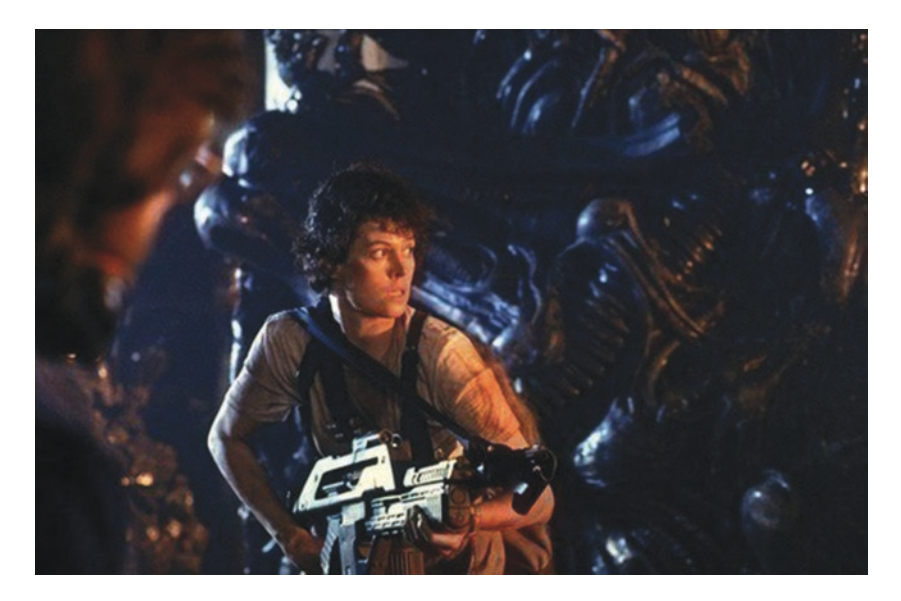
Fig. 1.2 Ripley, protagonist of the film Aliens , enters her Dantean space ( Aliens , 1986)

machinery of empathy and empathetic space, linking a kind of narrative space that appears across different myths, narrative paintings, novels, films, television shows and commercials. It would allow us to identify variations of empathetic space, drawing out certain underlying narrative structures, revealing the cues, materials and production design techniques commonly used to create these kinds of spaces across media forms. It should also reveal the social implications, if any, of these forms.