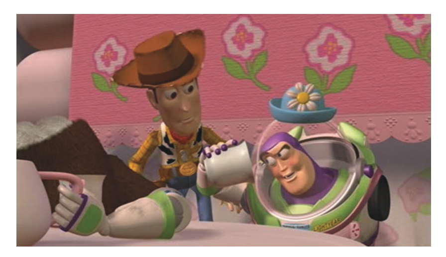
Fig. 3.15 Woody rescuing Buzz from the revelation of his vulnerability in Toy Story (1995)

Woody later finds a shattered Buzz raving deliriously while drunk on imaginary Darjeeling tea at a dolls' tea-party (Fig. 3.15): Woody pulls him away and then for the next ten minutes of the film has to take care of this mentally injured, utterly demoralized Buzz. But Woody never gives up on Buzz, and by the film's end with Woody's help Buzz has integrated this shock into his old character, his bravery and sunny outlook now married to a more mature self-understanding and a new bond of deep friendship with and appreciation for Woody. From this moment forwards Buzz stops being a dispassionate action hero and becomes a dramatic character with an inner life.