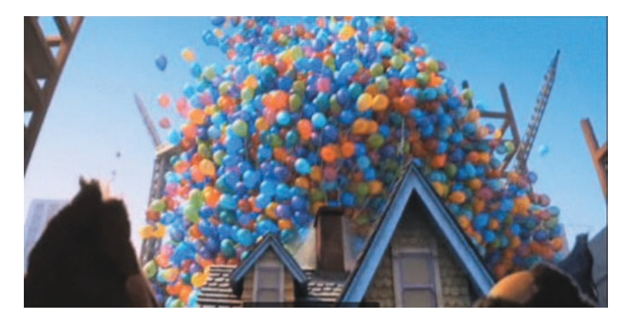
Fig. 3.14 The moment of release and ascension, of past and present, in Up (2009)

surviving husband, the film's main character, comes into the main story with his heart plunged into winter, a grumpy social isolate feeling terribly guilty that he was never able to take his wife on the exotic trips of exploration that she dreamt of. What's worse, he is soon falsely accused of a crime and is about to be forced from his home by a large corporation. Thanks to the machinery of empathy working in all of these story elements, our allegiances are now empathetically aligned with this mean old man. The film then launches into its main action when he unfurls his secret scheme: he floats the house from its moorings with thousands of tethered party balloons (Fig. 3.14).