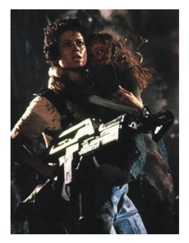
Fig. 3.9 Aliens (1986)

While these films use Dantean space for very extended sequences (in fact Amelie never leaves her sensibility), other films use Dantean space only in singular scenes. Consider for example The Official Story (1985). This powerful Oscar-winning drama revolves around a middle-class Argentinian couple raising a little girl they adopted some years before in