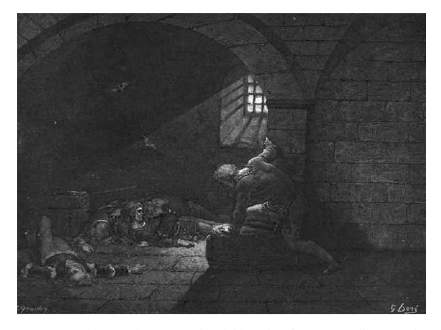
Fig. 3.2 Ugolino in the tower as his children die of starvation (illustration by Gustave Doré)

Ugolino's double-visioned space is not unique. Many of the characters in The Divine Comedy tell vivid tales of a specific past trauma, revealing themselves as still stuck like a fly in amber in that past Dantean moment while bound now in a specific and corresponding Dantean space. For example, in Canto 14 Dante meets Capaneus, a famously angry warrior from myth who was so overcome with fury in one battle that he directly attacked a god. Capaneus, still proud and unchanging, says "What I was in Life, I am now in Death", while sitting inert inside a cage of flaming bolts. He means that the raging anger that defined his character in life a fury powering his fighting prowess and rebellious nature and finally directing his famous death—has now become the cage that surrounds him.