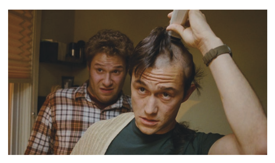
Fig. 1.8 The film 50/50 (2011) utilizes dramatic space: Ordinary locations with low spectacle. Empathy is instead created first by compassion for the main character, who has to deal with cancer, and then by the efforts of his friend to help

Many films in the drama and romantic comedy genre fit this model: think of 50/50 (2011), Spotlight (2015), Room (2015) or The Intern (2016). Think here too of the relatively unspectacular sets of most television comedies and dramas, of for example Transparent (2014–), Silicon Valley (2014–), Black-ish (2014–) or Louie (2010–). In all of these narratives spectacle may occasionally appear but it is not central to the storyline. This is not simply a question of budget but of foregrounding the emotional conflict playing out between the characters. Experienced filmmakers are aware that a spectacular setting can distract from or overwhelm certain kinds of story-lines and scenes. Here while the characters can be highly empathetic, their spaces are not.