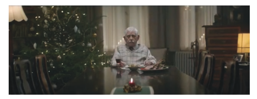
Fig. 1.7 Edeka 2015 Christmas commercial

There is a structural strategy beneath the way this tight story deploys our list of tactics. It begins with compassionate empathy tactics to tie us to the inner problems and pain of an individual character. Then after that empathetic bond is established, the story invokes the communal tactics of showing different characters doing good things for each other and then being brought together. As we shall see, this device of starting with