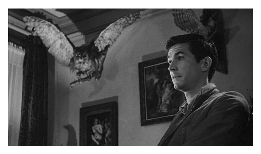
Fig. 3.6 Norman's parlor, a hellish Dantean space, in Alfred Hitchcock's Psycho ( Psycho , 1960: Dir. Alfred Hitchcock)

And consider Ripley of the Aliens franchise. Ripley's Alien spaces are complex Dantean spaces that she actively fights her way through. At the start of Aliens (1986) she wakes from a decades-long sleep in cryogenic