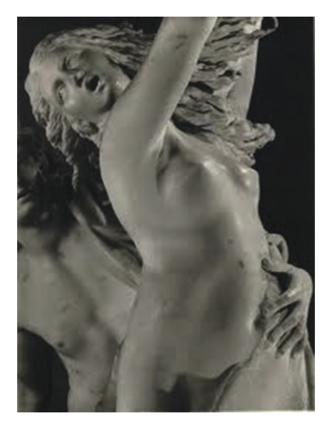
Fig. 10.4 Daphne detail, Apollo and Daphne

section—from her delicately-worked fingertips and from her smoothlyworked arms—than from either Apollo's far-more solid form or from her own bark-encased torso (Fig. 10.6).