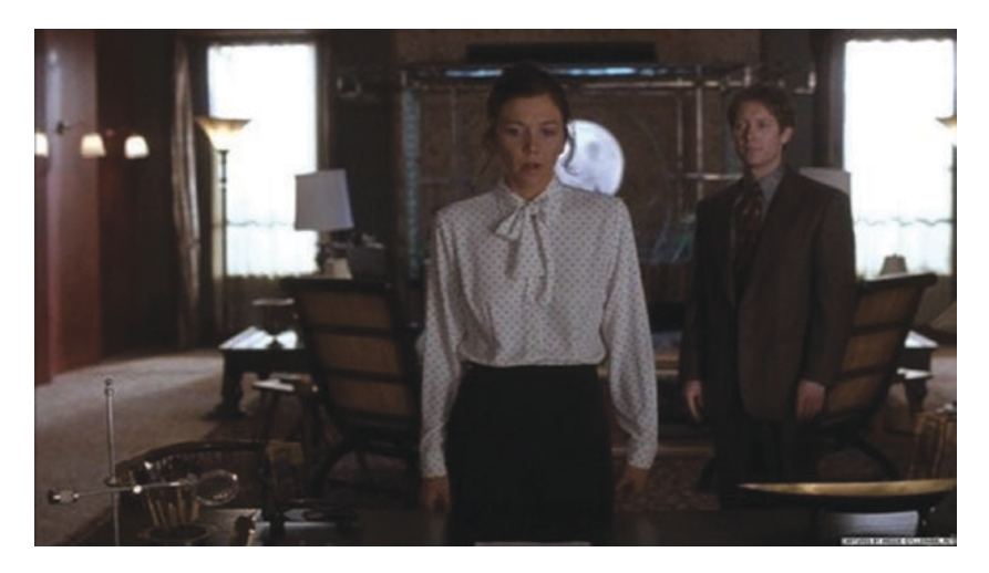
Fig. 4.3 The office, the tryst space in Secretary (2002)

The acoustic intimacy this allows permits a very specific kind of performance by our couple, a style that lets them reveal their longings for erotic power-relations. Thanks to this dead hush Edward can utter commands to Lee in an intimate near-whisper even from across a long room.