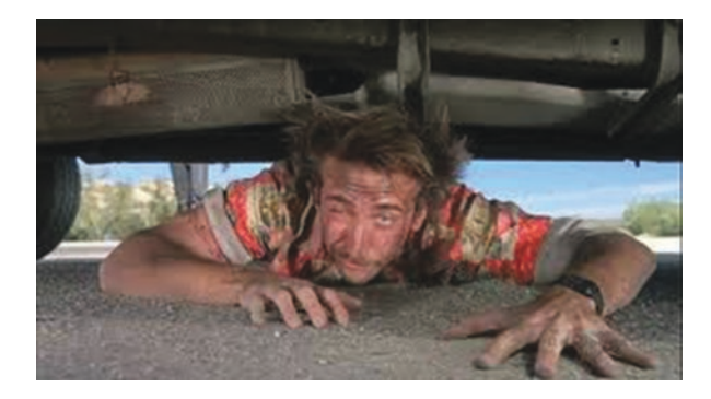
Fig. 5.5 Raising Arizona uses spatial categories, landscape and performance tropes reminiscent of the comedy WB cartoon Road Runner

It is often true that the spatial representation of neurotic characters tends to use balanced, organized, closed frames, indicating their own need to control their worlds, while psychotic characters are often represented by a kind of chaos intruding into the world's order. We actually see this equation of balanced with control in many of the neurotic characters and spaces we will discuss in this book, such as Star Wars, One Hour Photo , 50 Shades of Grey, Pleasantville, Mad Men and, arguably, The Graduate. And we will see the equation of psychosis with chaos in Apocalypse Now , most Bond movies and in the documentaries Tarnation (2003) and Waltz with Bashir (2008). But still this is not by any means an incipient meaning of the frame: the same categories of balanced and organized frames are used by contrast to represent safety and life in Aliens and in Hiroshima Mon Amour , for example. It is the underlying character that determines the meaning of these deployments of frame and not vice versa.