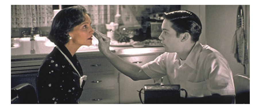
Fig. 8.1 Pleasantville (1998)

When Benjamin leaves LA to find Elaine at college in Berkeley, California, the nature of the spaces changes. They begin meeting in his Berkeley room, a bedraggled, grungy, real place completely different from the alienated Los Angeles milieus, and for the next twenty minutes as Benjamin pursues Elaine he himself, his clothes and his shiny red sports car will all get grungier and more bedraggled, growing 'more real' in the production design logic of the film. Only at the end, in their iconic moments of being lost on the bus, do we see their dawning realization that neither has the answer for the other. In the end Benjamin himself does not really come to grips with the alienation that surrounds them all.