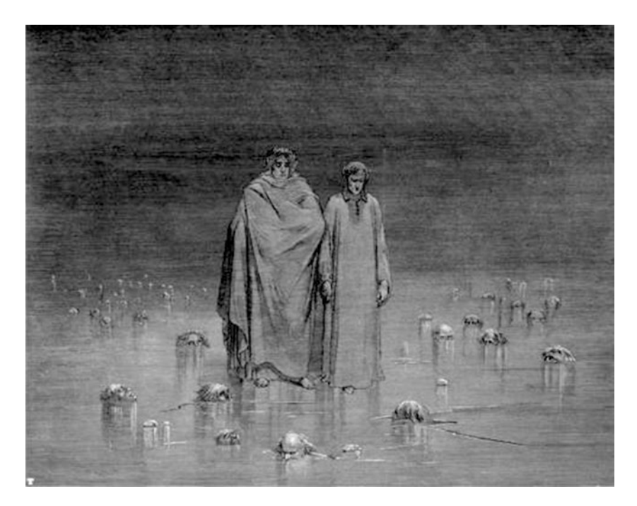
Fig. 3.1 Dante and Virgil on the frozen lake in the Ninth Circle of Hell where they meet Ugolino trapped in the ice (illustration by Gustave Doré)

space of nearly complete immobility, frozen together in ice up to their necks, bound in the endless tableau of this cannibalistic embrace. This ice-bound space is seen and felt by us through Ugolino's emotional perspective: it shows up through eyes shaped by those spirit-freezing moments alone with his children's bodies in that silent, dim-lit prisonroom in that forgotten Pisan tower. The two imprisonments are joined: the icy lake is informed by, imbued with, and in a sense created by that Pisan cell and its terrible events. In a psychologically real sense, Ugolino can never escape that cannibalistic moment in his shuttered tower: that torturing tower sped him directly into this specific personal space in Hell, a space he will never leave because it is burned too deeply into him. And so this is a space of double vision, one linking Ugolino's constant present to the arresting actions within that past Dantean moment.