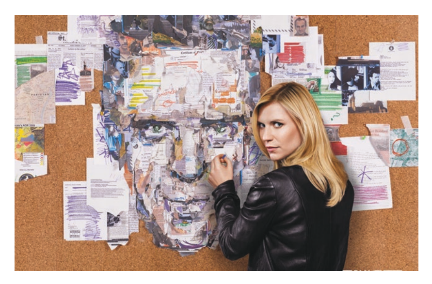
Fig. 8.2 Staged publicity still for Homeland that references Carrie's evidence wall ( Homeland 2011–)

fact spread and inculcated through media representation, gendered hierarchical structures and social bonds. And then by staging its visual conflict as a duel between two competing cinema spaces, the film then shows how this shared, jointly-internalized space can become more empathetic and rich through social interaction and intervention and by overt social and civic agreement and conflict. This theme, of how the rules of intimacy and of dramatic space are also public and shared projections and how they might be consciously changed to include a richer social and moral vocabulary and more complex and empathetic social bonds, is the subject of our final two chapters in Part III.