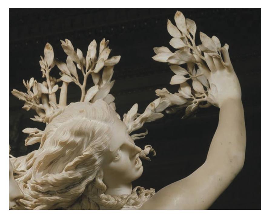
Fig. 10.5 Leafy extrusions from Daphne's fingertips, Apollo and Daphne

victim. In this perspective of understanding Daphne as she "turns into wood", we gain a double-vision: two different emotional moments are captured at once, and the friction between the two moments conveys both the terrifying moment of this girl's rape and the psychological result. For Daphne this moment of violation is a Dantean moment that fixes the rest of her life in a kind of frozen, insensate state.