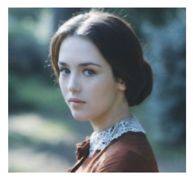
Fig. 10.12 Adjani's innocence. The Story of Adele H (1975)