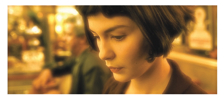
Fig. 10.10 Amelie (2001)

make-up emphasizing her similarly-luminous face uncreased by lines of experience, so well-characterizes an Amelie (Fig. 10.10) who feels simultaneously innocent and playfully mischievous: hers is the unseamed face of a child innocent.