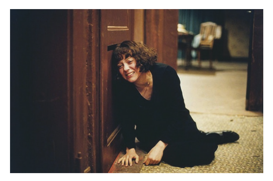
Fig. 10.11 La Vie en rose (2007)