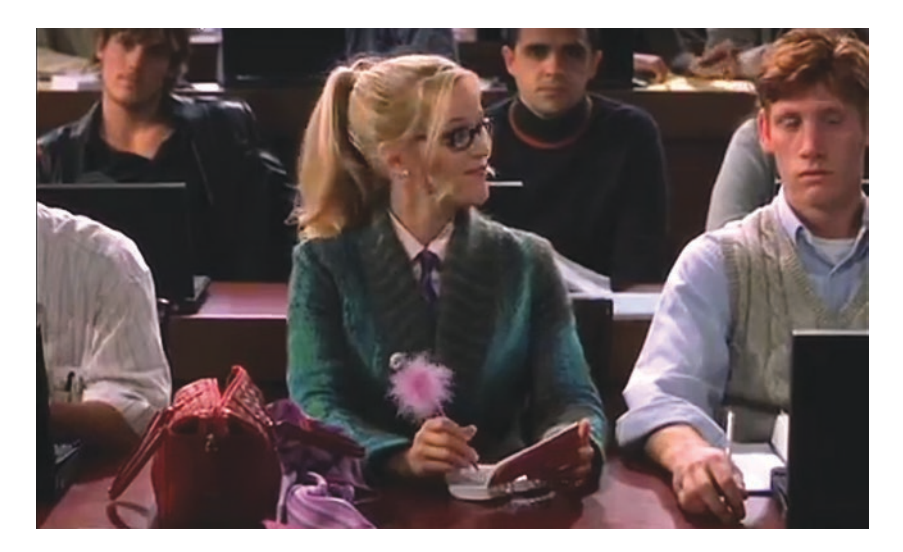
Fig. 1.4 Elle's props, spirit and affect empathetically contrast with the cold space of her Law School class in Legally Blonde

Compare this scene, though, to a similar invasion of pink into a similarly sombre room. In the film Legally Blonde (2002), our ditzy bright main character Elle Woods sits down in her first Harvard Law School classroom and, while everyone else in the room is dressed in sombre colors and opens a laptop, she pulls out a pink heart-shaped notebook and a pink pen with fluffy pink feathers (Fig. 1.4).