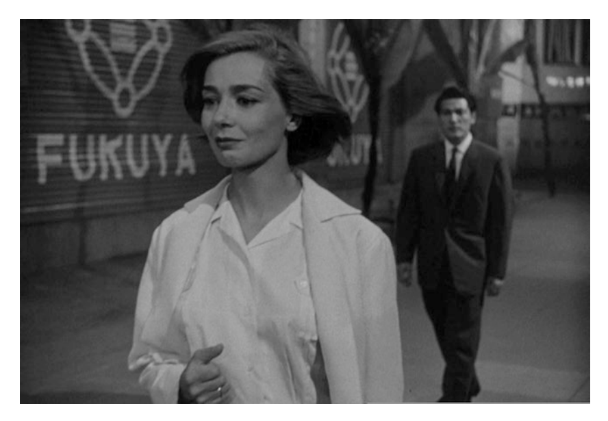
Fig. 6.3 A space that is Dantean for her and dramatic for him, Hiroshima Mon Amour

using the strict palette and techniques of neorealism of actual locations and the tropes of realism and traditional documentary, all glued together by personal and historical memory. This is character haunting but wedded to the history of a world at war. As these two adulterers drift through the seemingly-illusory streets of a rebuilt present that now carries little mark of what terrors happened here, they carry on their shoulders the story of an entire generation still shell-shocked and damaged by war.