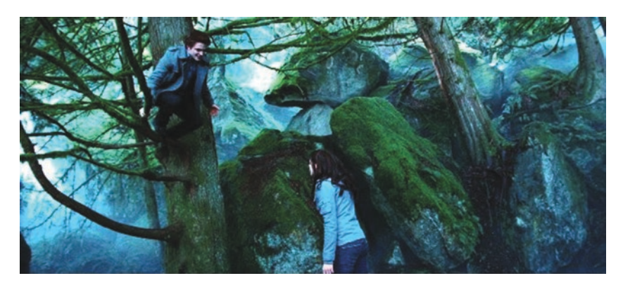
Fig. 4.2 The tryst space in Twilight (2008)

it is unclear if this undramatic drama is a film with two very under-characterized characters, or if this is a decently-drawn but undramatic portrait of two incomplete people.