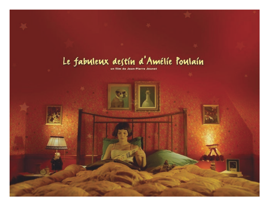
Fig. 1.1 Publicity material for the film Amelie (2001) showing her ensconced in her bedroom, one of the film's Dantean spaces

are entangled with the emotional struggles of their story's protagonist in a common, specific and identifiable way. We will argue that there is a narrative architectural form, one we will call Dantean space , that unifies them all. Understanding this powerfully empathetic resonance of place, protagonist and viewer has many implications, not least of which is that, by focusing on such narratives we begin to also understand the other less powerful forms of space and place in films and television. We learn that there are in fact three distinct forms of narrative architecture, three forms that make for viewers a kind of ascending ladder of emotional and empathetic involvement with protagonist and setting. In this book we will describe this topology of forms, showing how it manifests in many different examples, after which we focus on the possibilities of Dantean space.