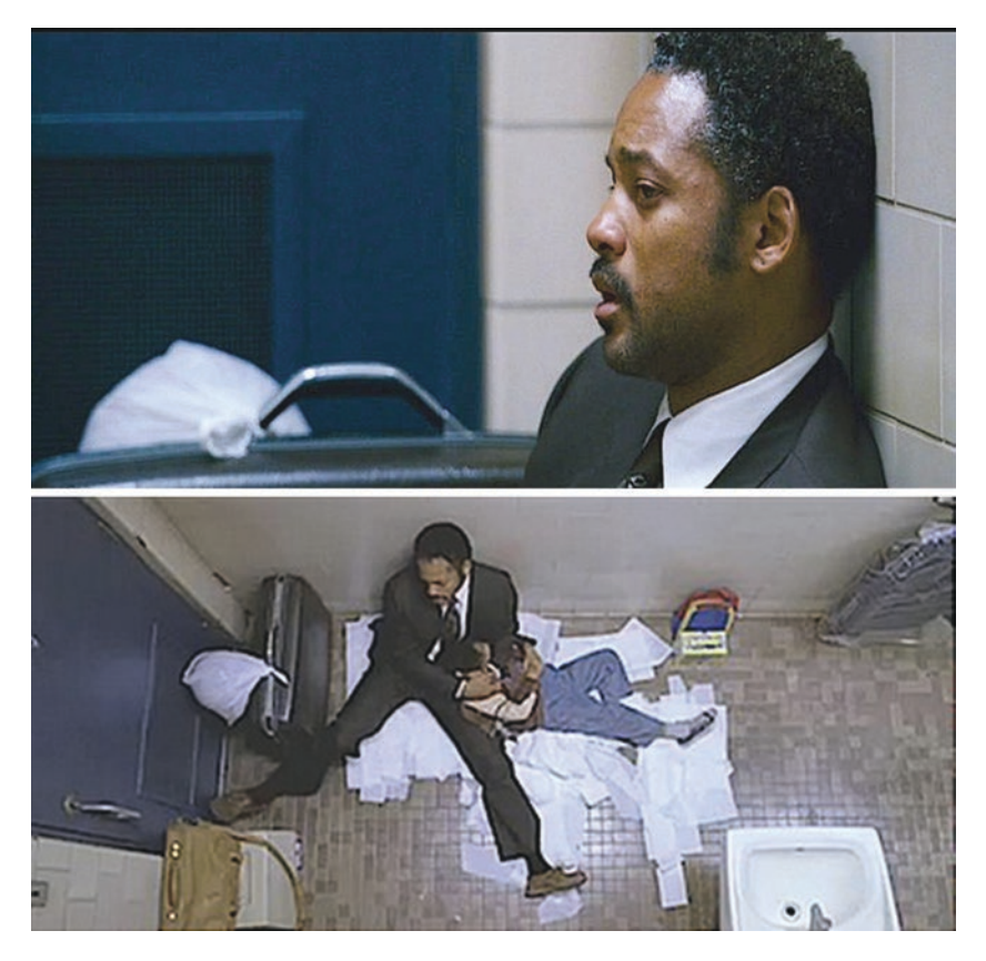
Figs. 1.5 and 1.6 Chris cradling his sleeping son in a public restroom in The Pursuit of Happyness (2006)

thin boundary emphasized when Chris, fearful his son will awake, has to cover the boy's ears with his hands to keep him from hearing the rattling of the door and his own sobs. This space, while neorealist, also vibrates with the unseen fantasy-cave that little Christopher has created with his dad's help, making this restroom into a projection of the dad's harsh truth and the boy's innocent fantasy, of their homelessness and mutual care, and of the external and internal conflicts of the dad. By knowing this narrative history we see not just a public bathroom but a space imbued with a father's struggle, love, and fears and a child's innocence