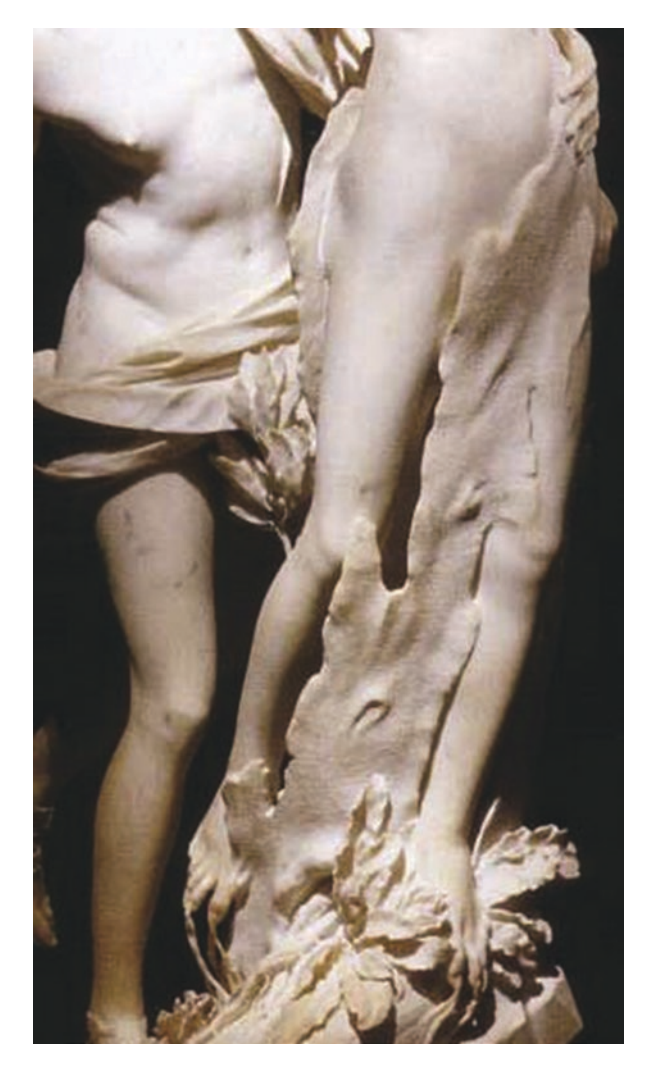
Fig. 10.6 Bark encased torso, Apollo and Daphne

this tableau is open—a dispassionate, a dramatic or a Dantean perspective can be brought to bear depending on what homologies, subjectivities and form of time the viewer grants to this tableau. It is a decision about which figure and details to pay attention to: this sculpture allows us to