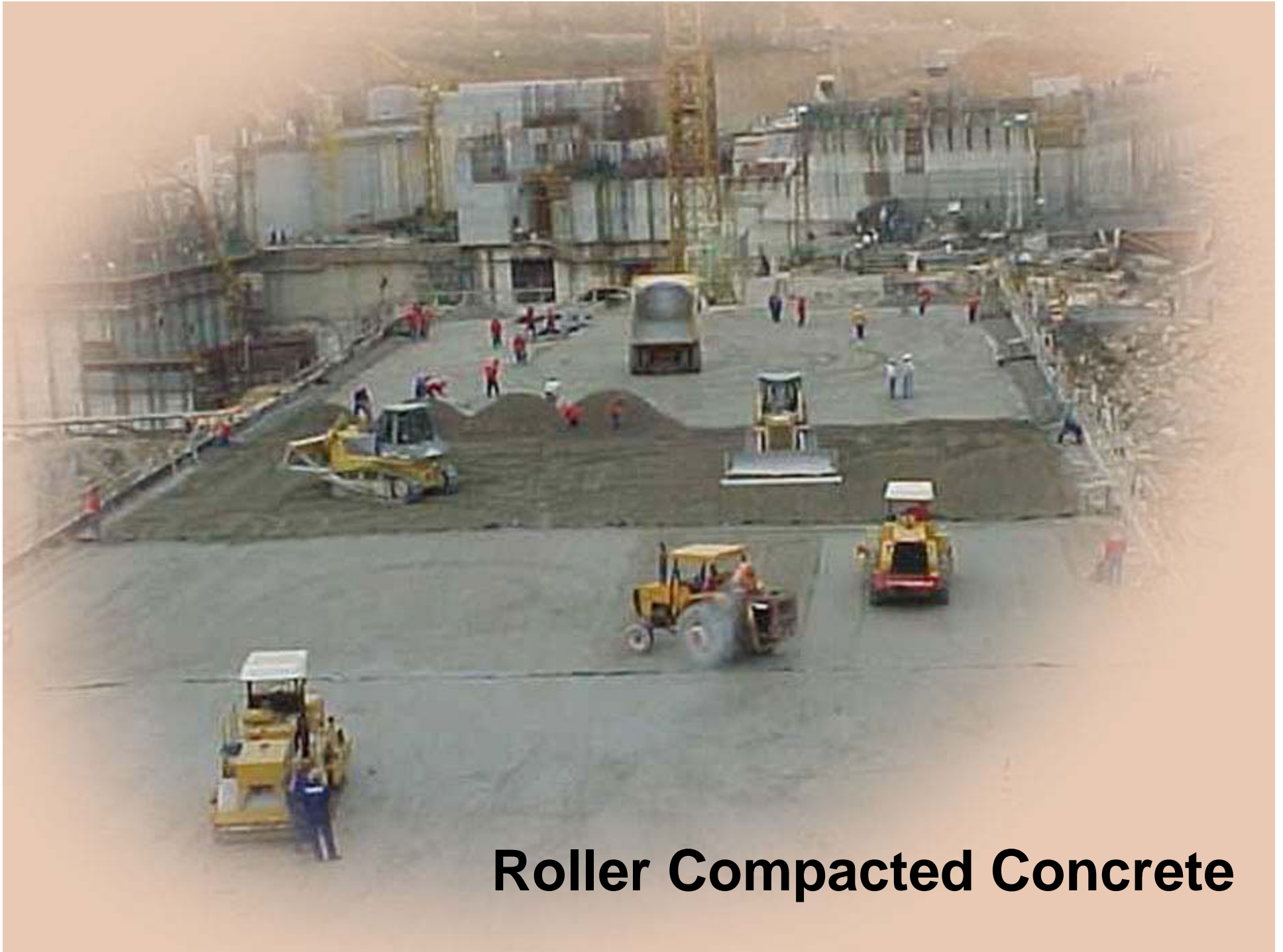
Roller Compacted Concrete